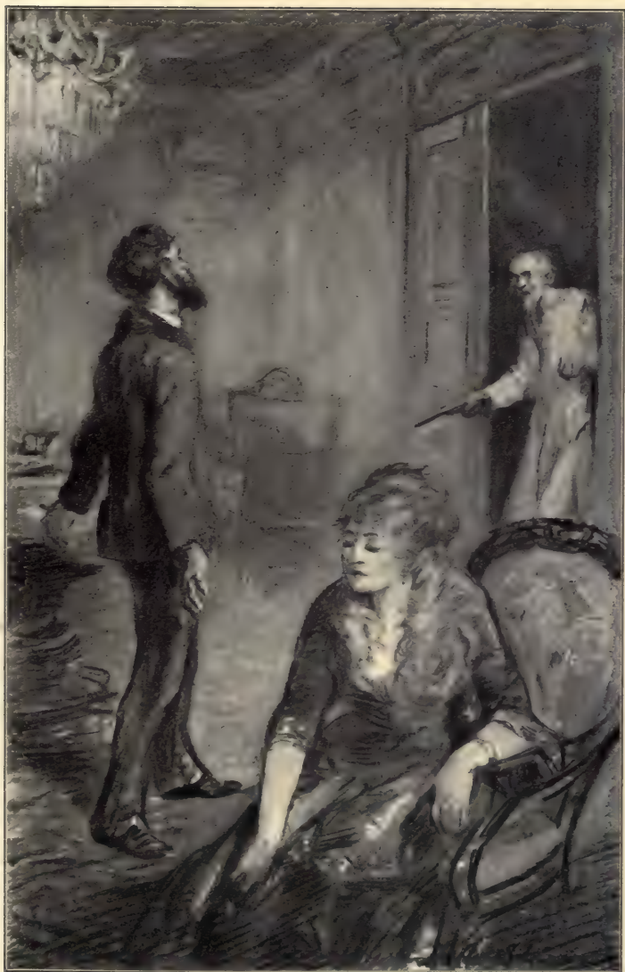
JACQUES DREW HIMSELF UP, AND SAID: "SIR, AVENGE YOURSELF"